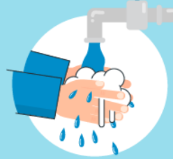
Wash your hands before touching the mask