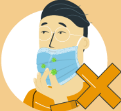
Do not remove the mask to talk to someone or do other things that would require touching the mask