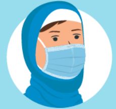
Adjust the mask to your face without leaving gaps on the sides