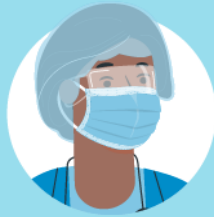
Ensure the colored-side faces outwards