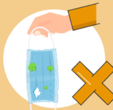
Do not use a ripped or damp mask