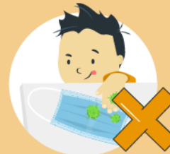
Do not leave your used mask within the reach of others