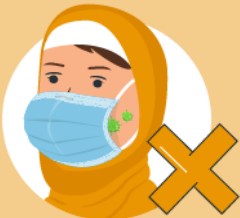
Do not wear a loose mask