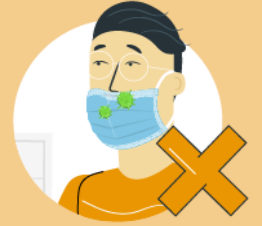
Do not wear the mask only over mouth or nose