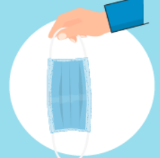
Inspect the mask for tears or holes