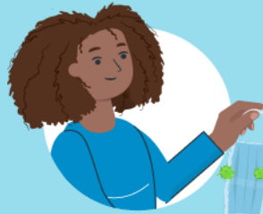
Keep the mask away from you and surfaces while removing it