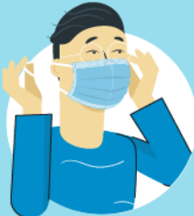
Remove the mask from behind the ears or head