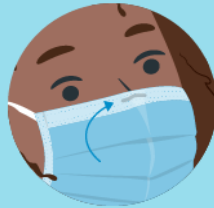
Place the metal piece or stiff edge over your nose