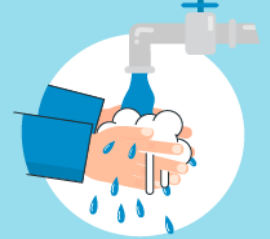
Wash your hands after discarding the mask