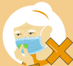
Do not touch the front of the mask