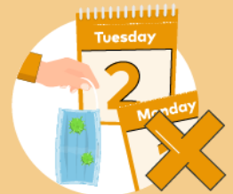
Do not re-use the mask

Remember that masks alone cannot protect you from COVID-19. Maintain at least 1.5m distance from others and wash your hands frequently and thoroughly, even while wearing a mask.