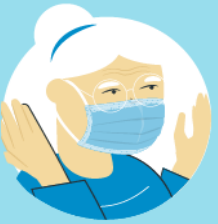
Avoid touching the mask