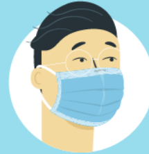
Cover your mouth, nose, and chin