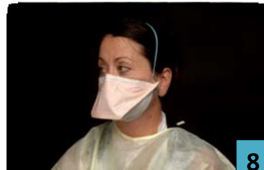
8 PLACE THE UPPER HEADBAND ON THE CROWN OF YOUR HEAD. THE BAND SHOULD RUN JUST ABOVE THE TOP OF YOUR EARS