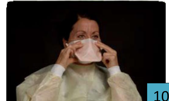
10 CONTINUE TO ADJUST THE MASK UNTIL YOU FEEL YOU HAVE ACHIEVED A GOOD AND COMFORTABLE FACIAL FIT.

A 'fit check' must be performed each time a P2 / N95 mask is worn