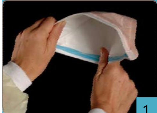
1 SEPARATE THE EDGES OF THE MASK TO FULLY OPEN IT

A P2 and N95 mask offers protection from diseases spread by airborne transmission: February 2020