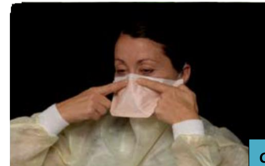
9 GENTLY CONFORM/PRESS THE NOSEPIECE ACROSS THE BRIDGE OF YOUR NOSE BY PRESSING DOWN WITH FINGERS UNTIL THE FIT IS SNUG