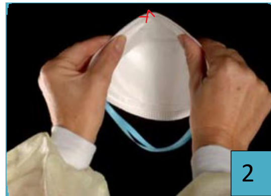
2 BEND THE NOSE WIRE TO FORM A GENTLE CURVE. THE NOSE WIRE REPRESENTS THE TOP OF THE MASK