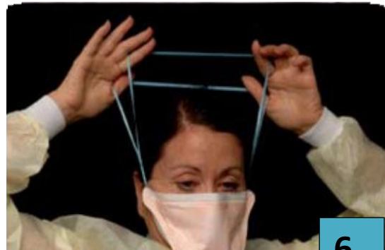
6 PULL HEADBANDS UP AND OVER YOUR HEAD