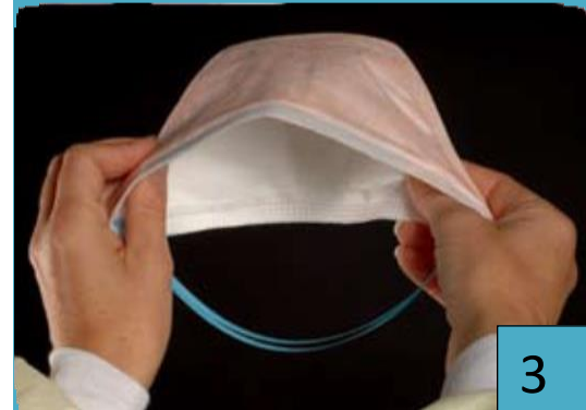
3 HOLD THE MASK UPSIDE DOWN TO EXPOSE THE TWO HEADBANDS