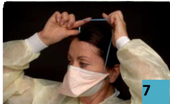
7 PLACE AND POSITION THE LOWER HEADBAND AT THE BASE OF YOUR NECK (UNDER YOUR EARS)