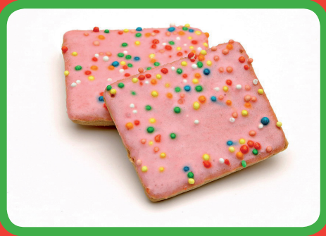
2 Sweet Biscuits

One level teaspoon of sugar is equivalent to 4 grams of sugar. All values were rounded to the nearest whole number.