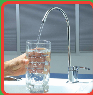
Tap Water only